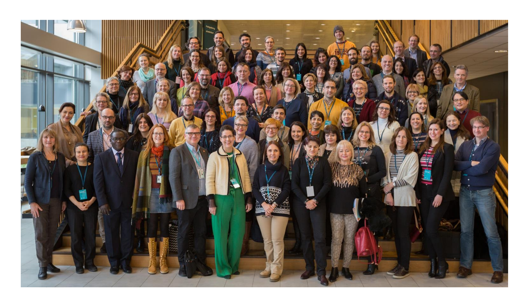
EVBRES participants at the first Workshop meeting in Bergen, Norway. February 2019